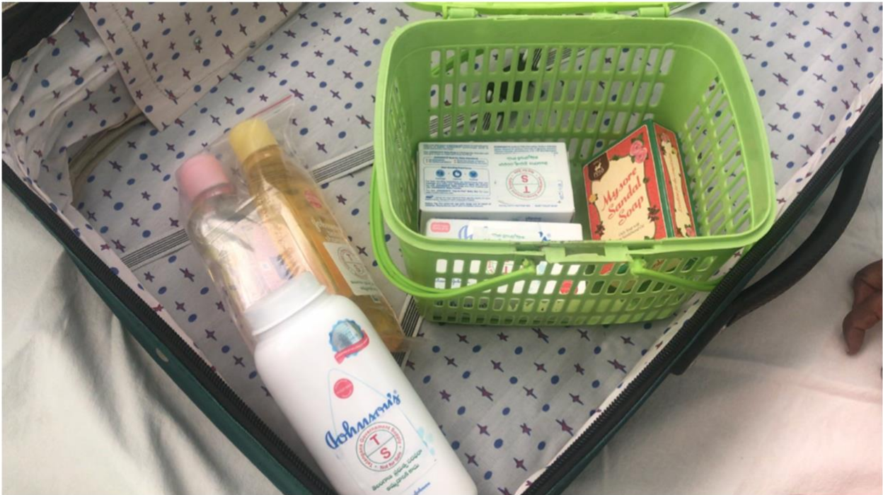
KCR Kit is inspired by the success of the Amma Baby Care Kit Scheme

Some of the J&J baby powder products exported to Bangladesh were donated (recipients not identified). J&J also donates talc-based baby powder to mothers in India.