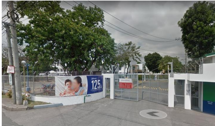
Entrance of J&J baby powder plant, Parañaque City, Philippines.

J&J continues to sell talc-based baby powder in the country. 21 “Johnson’s Baby Powder has become a part of the Filipino family’s personal care routine for over 60 years. Johnson & Johnson remains steadfastly confident in the safety of talc-based Johnson’s Baby Powder,” read a company statement issued on May 19, 2020. 22