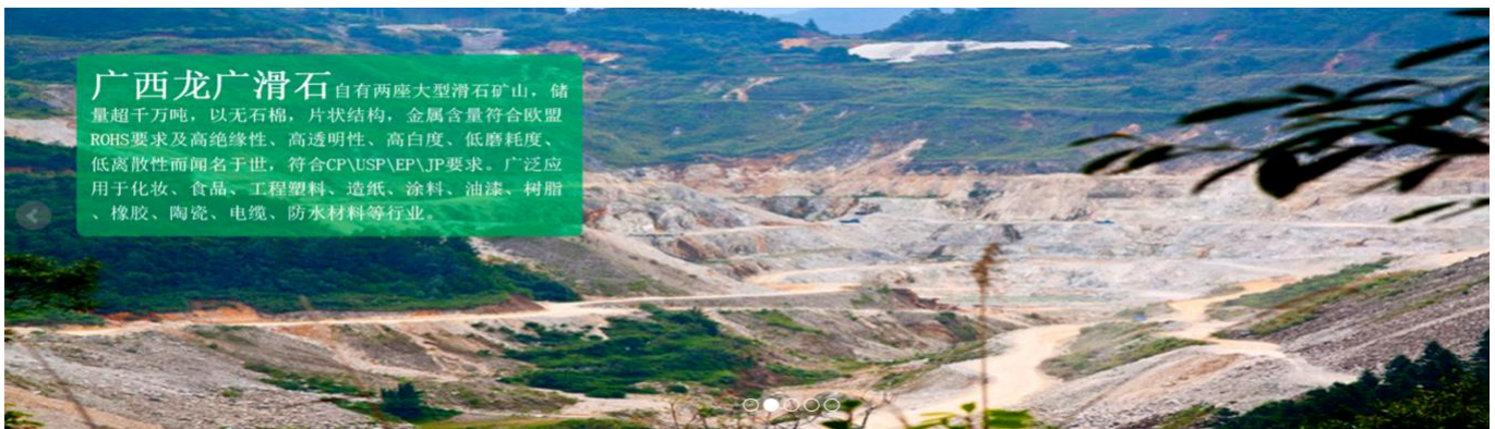
Screenshots from Guiguang Talc Development company webpage. Guiguang Talc is a leading source of talc used in J&J Baby Powder products worldwide. 6